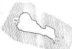
PIANTA DEL POZZO (a-a)